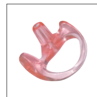
Optionally different earmolds available